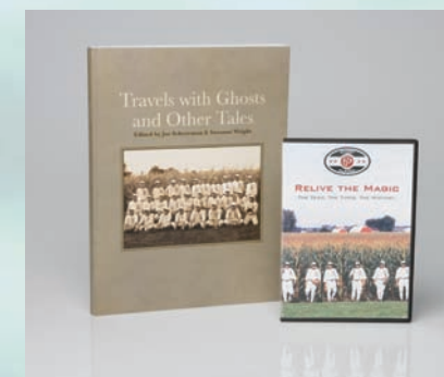
Shepherd Incorporated was proud to sponsor both the book and the movie.

Travels with Ghosts and Other Tales is a new book that celebrates the Ghost Players and the Field of Dreams, and was commissioned as a companion to the documentary. The book is a melding of historic images and musing of the players, the families, and fans of the Ghost Players, and SABR (Society for American Baseball Research) contributors.